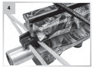
The bowstring sits on the barrel's flight deck while the cable saver and cables slide into the cable slot.