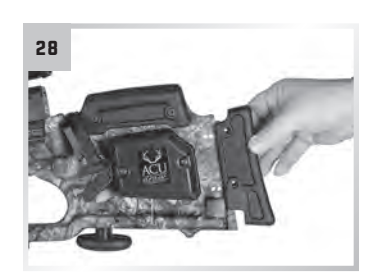
Slide rubber butt plate into desired position.