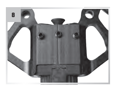
Main Assembly Bolt (and washers if required) Main Assembly Bolt's Locking Setscrew Foot Stirrup Locking Setscrews.