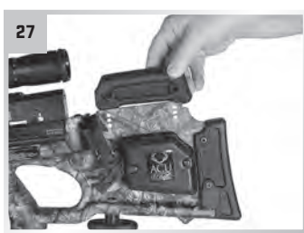
Slide cheek piece over desired alignment holes.