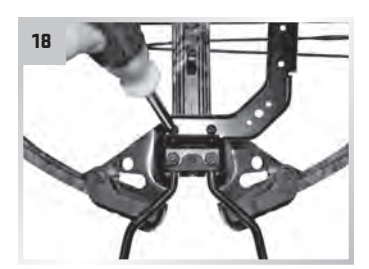
Attach the side-mount bracket to the quiver mounting bracket assembly.

Some TenPoint models are equipped with an adjustable rubber butt plate to match up with a shooter's length-of-pull.