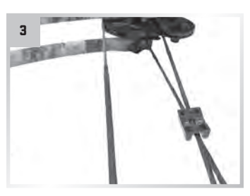
The mini-cross cable saver sits on top of the cables where they cross.