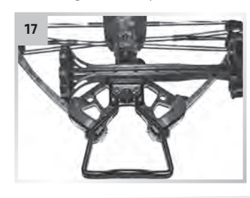
Insert the 3-Arrow Instant Detach Quiver into the female bracket and lock into place.