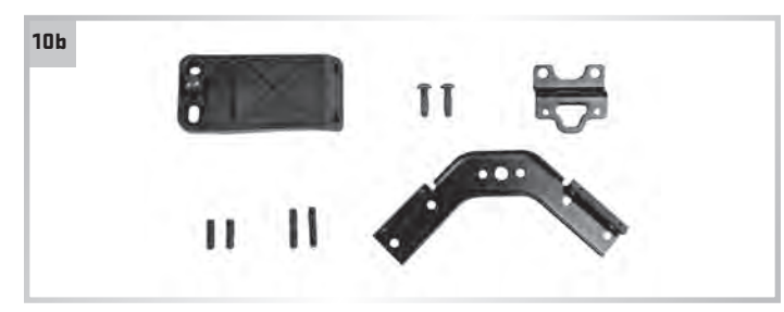
3-Arrow Instant Detach Quiver Mounting Kit

Attach the rubber hose to the quiver cup. First, from the bottom of the quiver's cup, insert both ends of the rubber hose approximately twoinches into each hole and insert a hose plug into each end. Then, pull the hose back toward the bottom of the quiver cup and seat the hose plugged ends into the counter-sunk holes (photo 11).