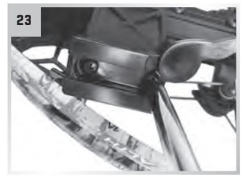
Install the quick disconnect (female) attachment.