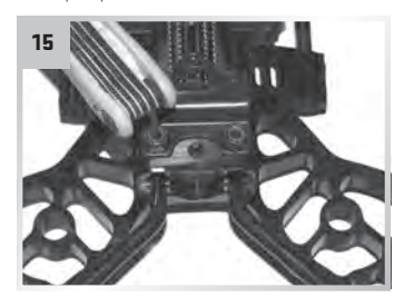
Insert the 3/4-inch setscrews & Nylock nuts (use the 1-inch setscrews for Wicked Ridge crossbows).