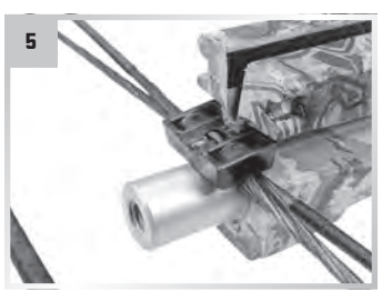
Hold the mini-cross cable saver in position while sliding the bow assembly onto the stock assembly.