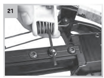
Remove sling stud and pan-head screw closest to the foot stirrup.