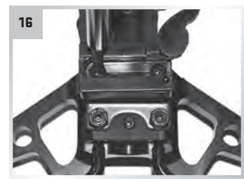
Install the quick disconnect (female) attachment.