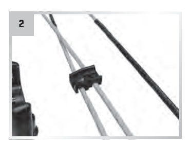
The ramped portion of the standard cable saver must face the riser (bow assembly).

You are now ready to test-fire your crossbow and fine-tune your sights (See appropriate Cocking, Loading & Sighting sections in the General Manual).