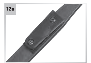
Attach quick detach (male) attachment.