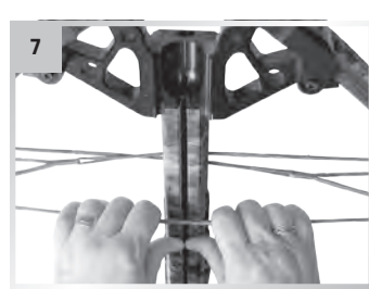
Pull up and back slightly on the bowstring to seat the bow assembly.