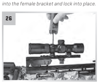
Attach the top rings.