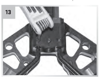
Remove 1/4-inch setscrews holding foot stirrup in place.