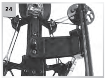
Insert the 3-Arrow Instant Detach Quiver