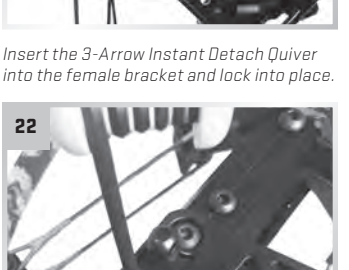
Insert and tighten two 1/4-20 x 3/4-inch