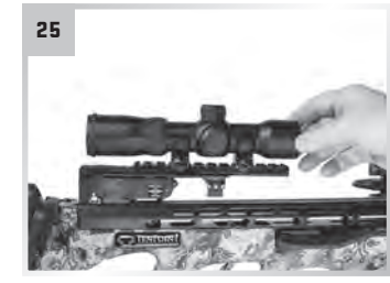
Determine scope position and install the bottom rings onto the dovetail mount.