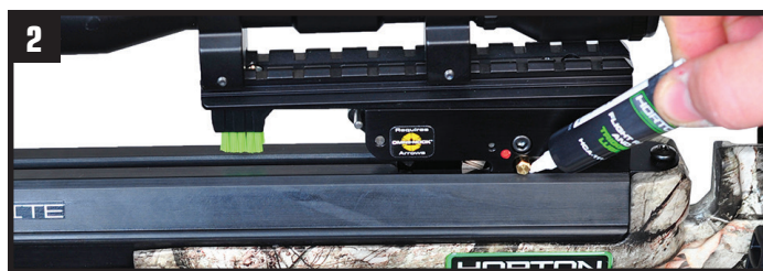
Lubricate the trigger through the safety slide window.