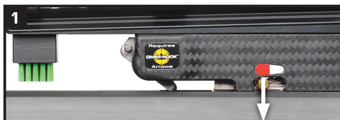
Make sure the trigger's safety is in the forward, FIRE position (forward, toward the red dot) before cocking your crossbow.