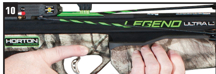
Position finger on the side of the stock.