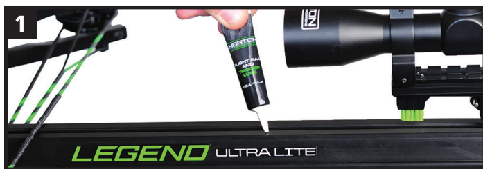
Lubricate your flight rail approximately every 75 to 100 shots with flight rail lubricant.

Note: Unauthorized repairs may void your warranty. If repairs are necessary, contact the Customer Service Department at 330-628-9245 or email your request at www.hortoncrossbows.com for a Return Authorization Number and shipping and payment instructions.