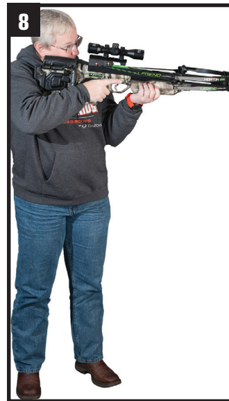
Proper foot position.