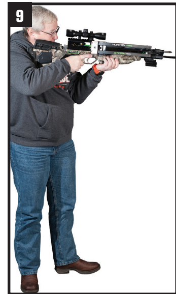
Proper foot position.