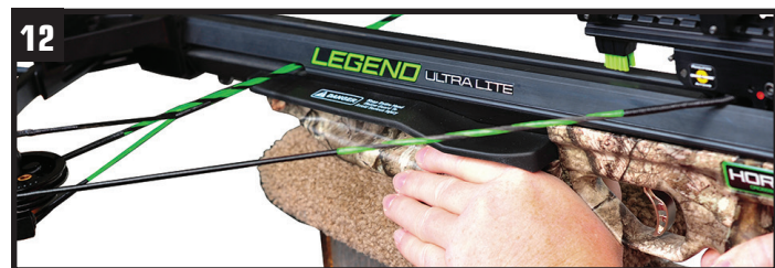
Keep your thumb and fingers below the flight deck and away from the cables to avoid injury.