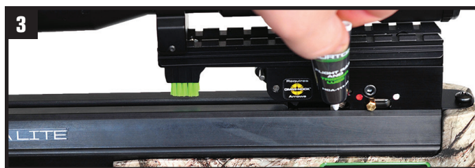
Apply a drop just inside the closed end of the trigger's string slot.