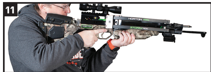
Keep elbows close to your body.