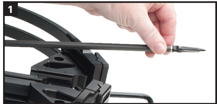
PROPER POSITION. Hold the arrow with your index and middle finger and your thumb just behind the broadhead.