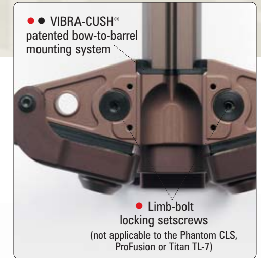
●● VIBRA-CUSH® patented bow-to-barrel mounting system