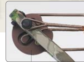
Precision CNC machined aluminum wheels or cams

● Black dot indicates a core performance feature.